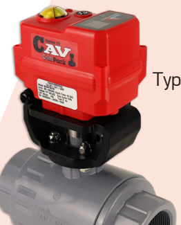
Type-21/21a Ball Valves Sizes: 1/2" - 2"